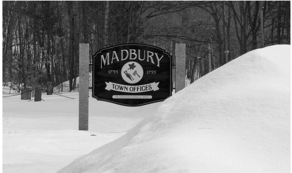
Town Hall sign with snow.

A public access public computer is now available at Town Hall for you to check property card information. There is also a link on the town's webpage so that you can access your basic assessment information online. The town website also contains copies of the Town Ordinances and